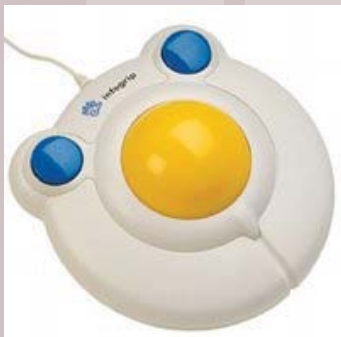
BIGTrack Trackball Mouse

AT devices range from the very simple, or “low tech” to the complex, or “high tech.” Examples of low tech devices include items like magnifiers, tape recorders, clothing buttoners, and other aids for daily living.